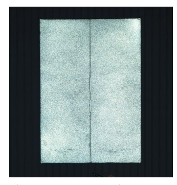
Excellent for making almost any surface extraordinarily reflective.