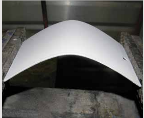
Although we don't recommend it, your coated metals could be bent 19% before permanently damaging (cracking) the EonCoat coating.

So EonCoat ceramics have many times the flexibility (or ductility) needed to handle the typical movements of steel. This includes the flexing, expansion and contraction found in bridges, storage tanks, pipelines, and so on.